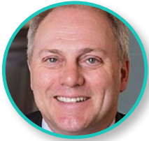
Steve Scalise District 1 57.3%