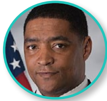
Cedric Richmond District 2 52.1%